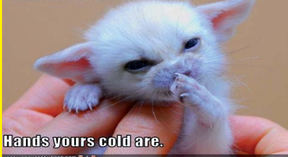
Random thought for the day:

If all the world is a stage, where is the audience sitting?