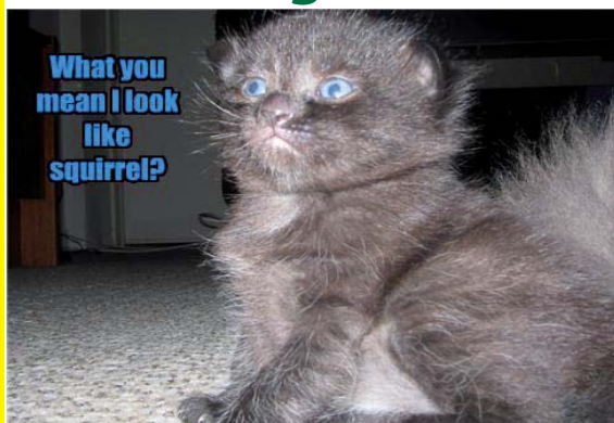
Yoda kitteh sez